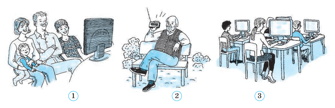
B. What, in your opinion, is the story behind the picture you've chosen?

Remember your favourite TV programme (a film, a TV show, a sports programme etc) and speak about it.